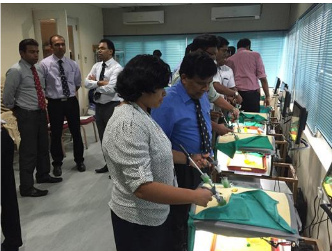
The Skills Development Centre, 2015