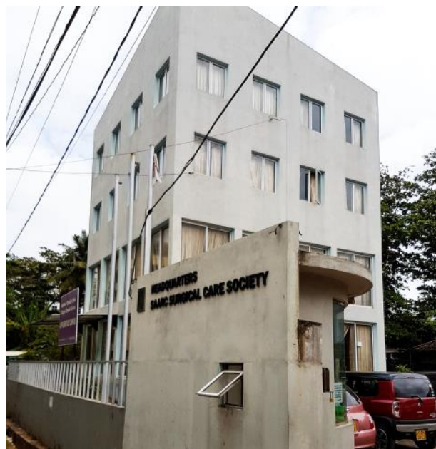
The proposed new Skills Development Centre

The creation of the Sri Lanka Chapter of IHPBA has been a significant step forward in providing HPB care locally. The Chapter will continue to be supported by IHPBA and AHPBA, and will be active in co-ordinating this and future outreach projects to Sri Lanka.